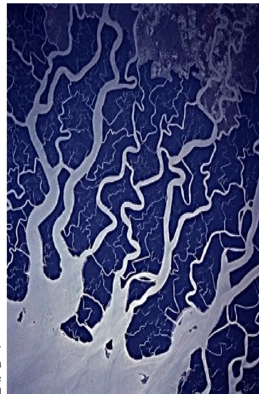
Aerial View of Delta

Where you are now standing was once the edge of a warm, shallow sea. Far to the southeast, a mountain range the size of the Himalayas was building, and rivers from these mountains were sending red, iron-rich sediment from the mountains into the sea, forming a large, muddy delta. The sea was teeming with life, but on land, no plants or animals had yet developed.